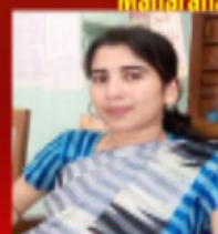
Convener Mt Fotema khatun Faculty, Dept. of Defence studies